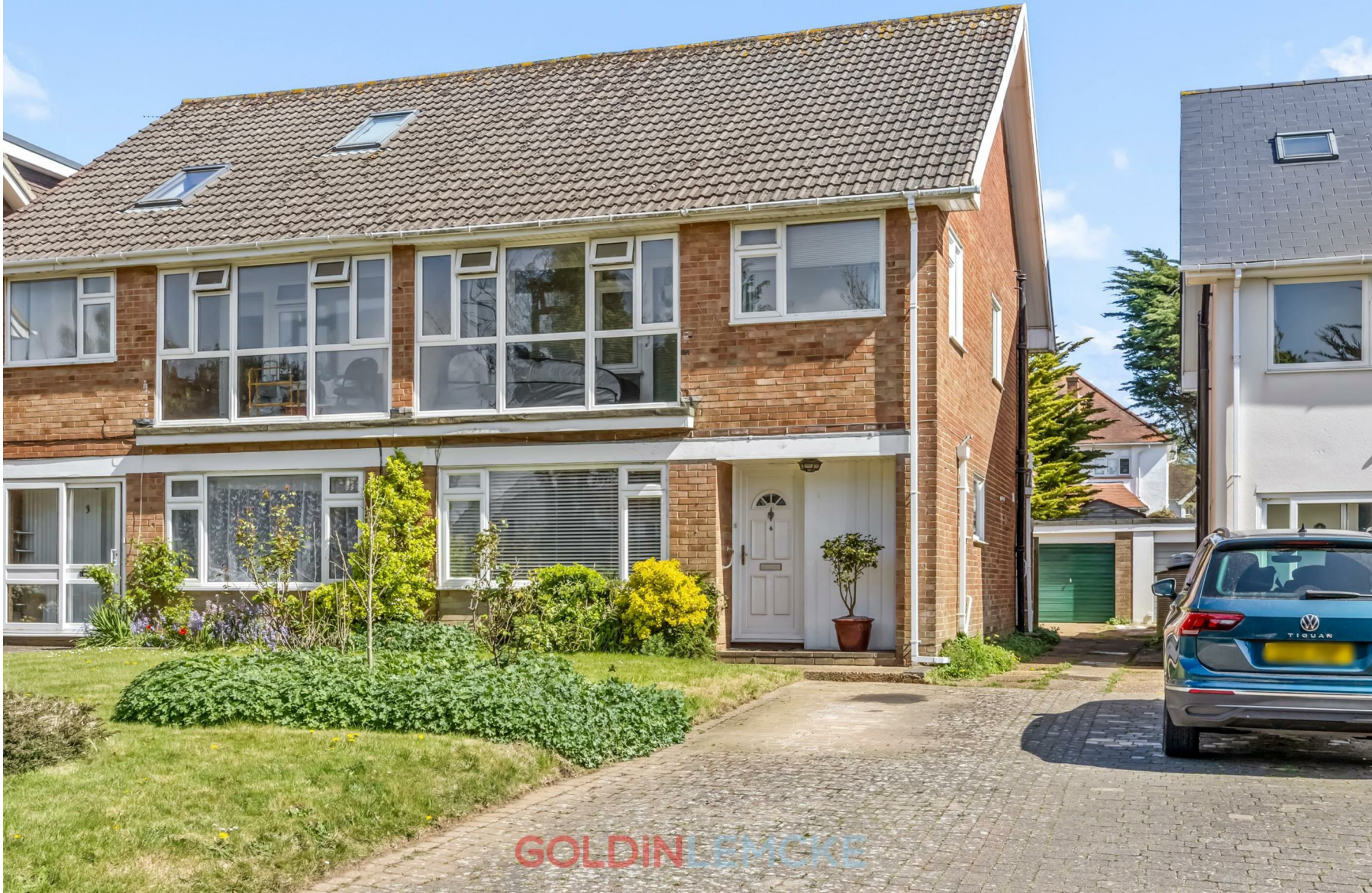
The Paddock, Hove, BN3 6LT £730,000 - £760,000 Guide